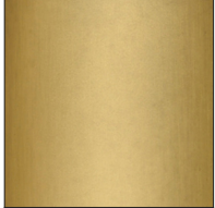
Pewter - PWT